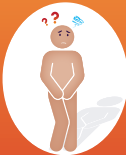
Not much pee