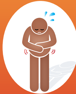
Pain or 'feeling worse than ever'