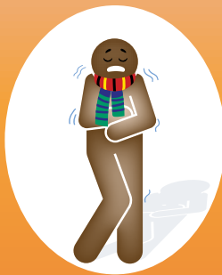
Feeling really cold