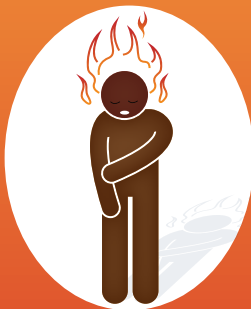
Feeling really hot