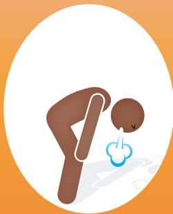
Short or fast breath