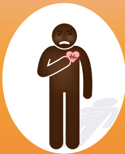
Heart beating too fast