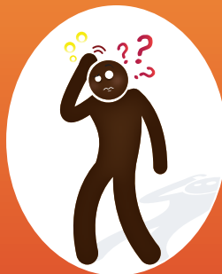
Feeling really tired or confused