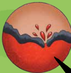
Valve damaged from rheumatic heart disease