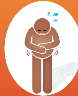
Pain or 'feeling worse than ever'