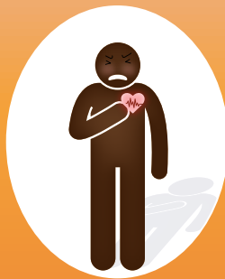
Heart beating too fast